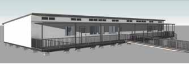
12.0m x 27.2m Classroom